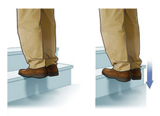
@ Healthwise, Incorporated

Note: Stretching the plantar fascia and calf muscles can increase flexibility and decrease heel pain. You can do this exercise several times each day and before and after activity.